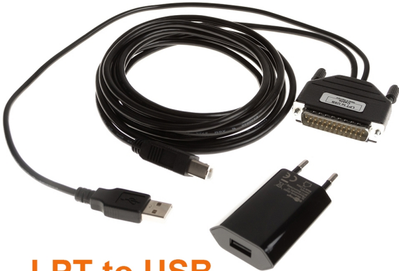
LPT to USB